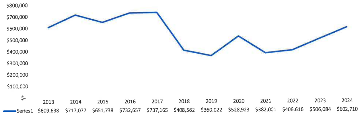
OHP Cost by Year